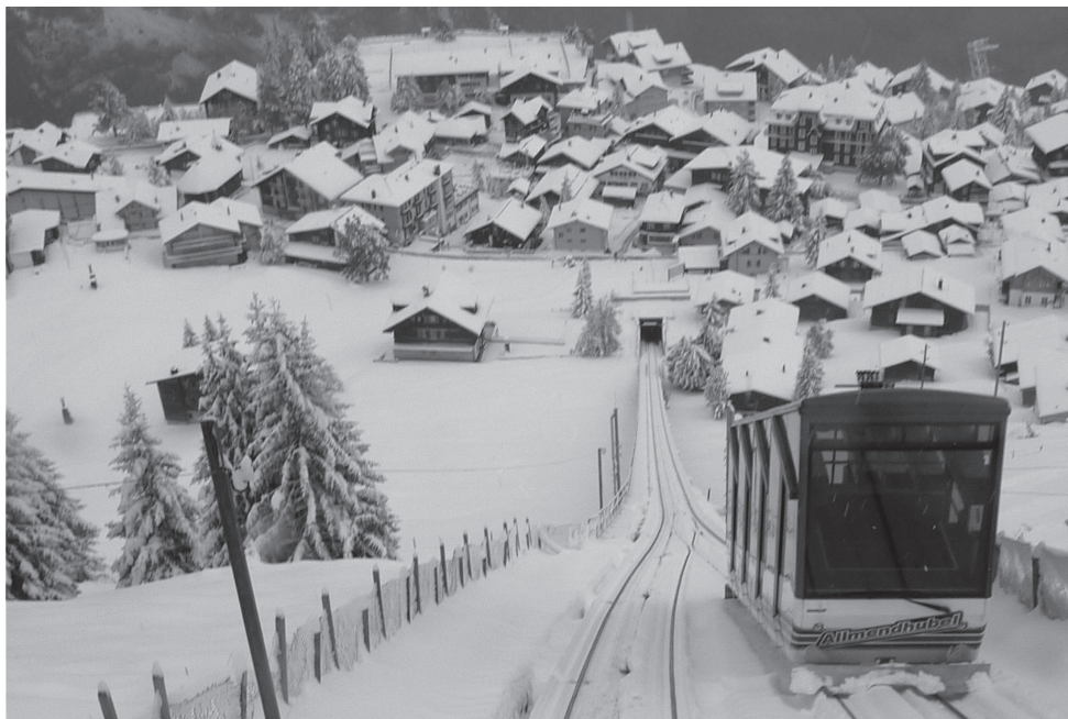
The Allmendhubel funicular and the Swiss town of Mürren.