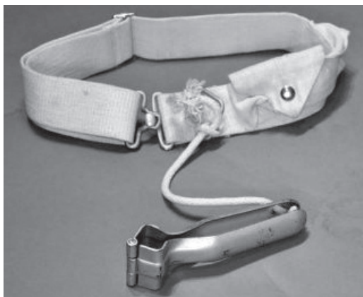
A New Zealand rope tow “nutcracker” as commonly used around our skifields, and a US de luxe version which is on display in Colorado.