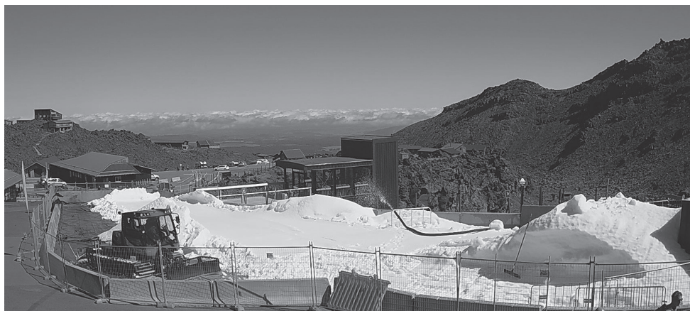
RAL this summer used its snow factory to provide January sledding outside the Top O' the Bruce. RAL snow was also trucked to the beach front at Mt Maunganui.