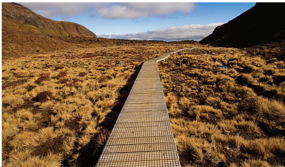
A walkway on the ever popular Tongariro Alpine Crossing.