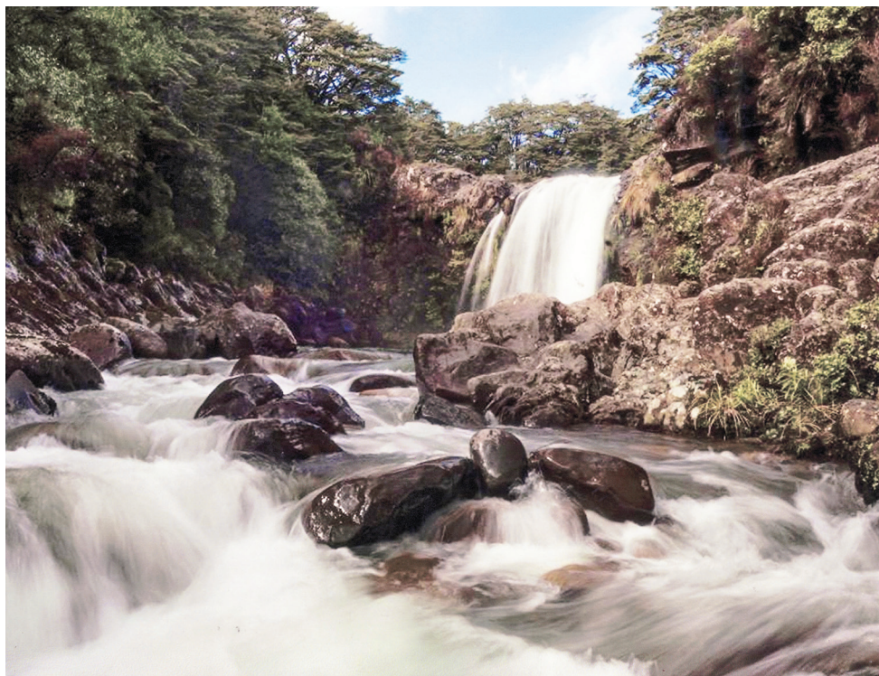
Tawhai Falls near the Chateau.