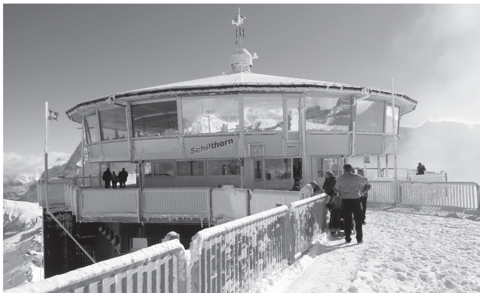
The Schilthorn revolving restaurant at 3000m in the Swiss alps which featured in the James Bond film On Her Majesty's Secret Service. The annual Mürren Inferno amateur ski race starts just below this peak.