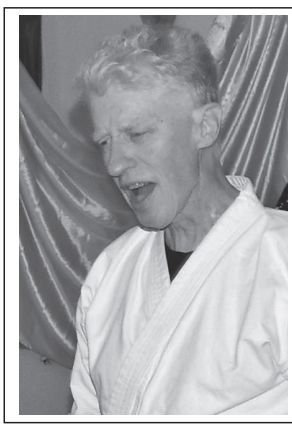
Dress up night during Winter Party.