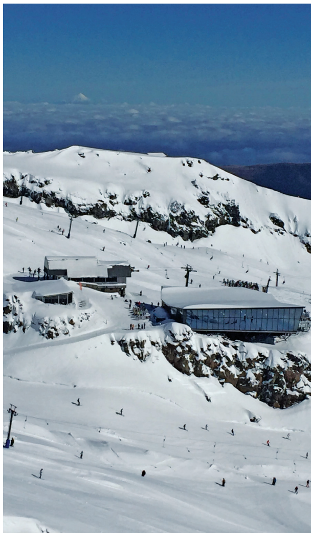
Wonderful skiing at Whakapapa last season.