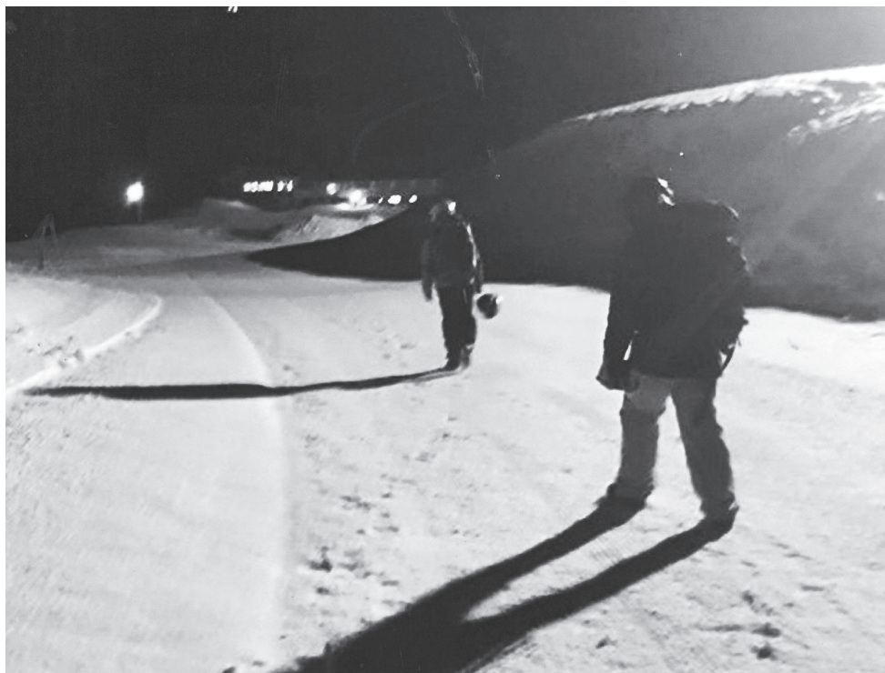
Upper: The Chateau seen after a snowfall last season. Lower: Made it to Hut Flat and almost to the Lodge.