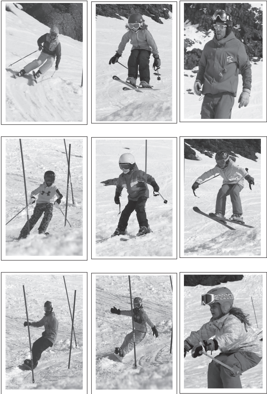
Fun racing in the school holidays...