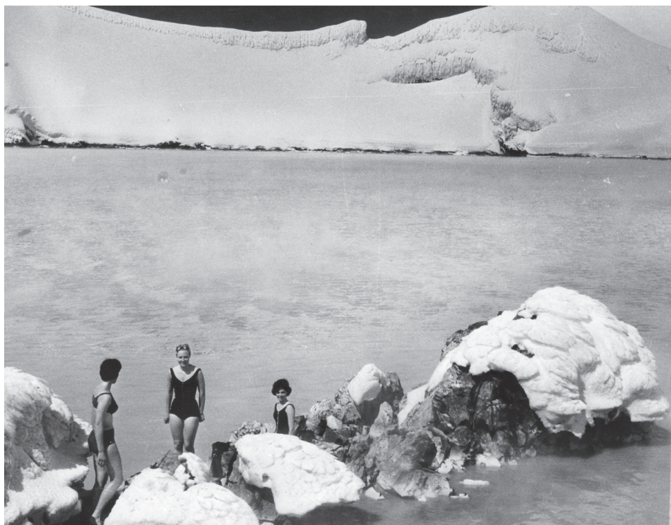
Upper: Riding the second chairlift during a minor eruption in 1966. Lower: Swimming in Crater Lake in 1964. You could swim out about 25 metres before the water was too hot.