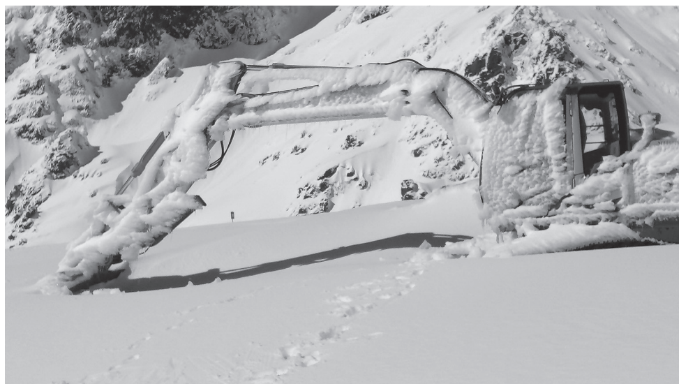
Upper: Timing the Haensli Cup in Te Heuheu Valley. Lower: A digger seen after the big September snowfall.