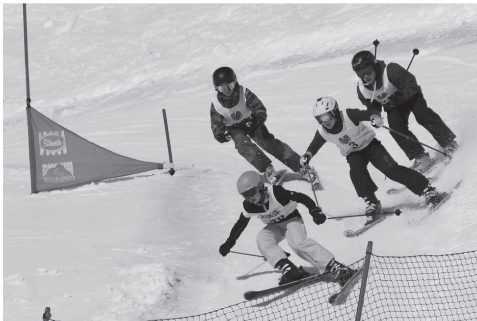
Upper: Late afternoon fun racing during the school holidays. Lower: Racing in the North Island primary school ski champs.