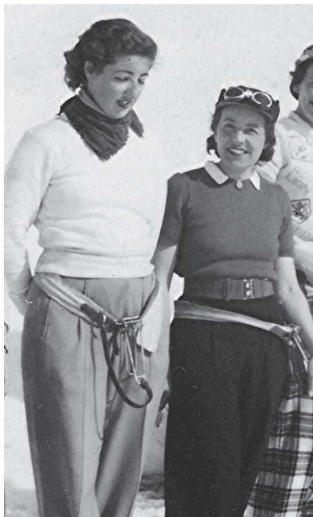
RSC members wearing nutcracker ski tow belts outside the old RSC Hut in 1949.

The new Colorado Snowsports Museum has a Bosquet Ski Tow Rope Gripper on display.